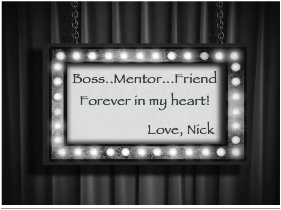
10 - THE 2024 JIMMY AWARDS®/NATIONAL HIGH SCHOOL MUSICAL THEATRE AWARDS®

He remains an active arts education philanthropist and advocate, and his Find Your Light Foundation helps enrich the lives of young people through arts, education, and cultural awareness.